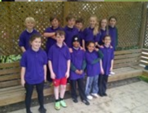
Pupils at Shirley Junior school looking smart and ready to lead!

Congratulations to all those who have taken on the task and will undoubtedly prove to be an Inspiration to others.